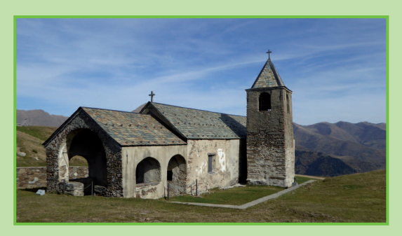
The church of San Lucio

Next to the church, you can find Rifugio San Lucio, a former Customs police