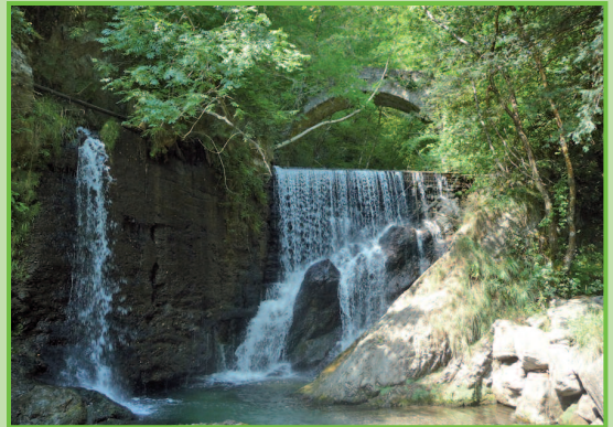
Tobi waterfalls

Continue along via Galbiati, past the church dedicated to the Saints Caterina, Bernardo and l'Apostolo delle Indie, till you end up on the road that leads up to Naggio. Cross it and pick up via Milano in the direction of Gonte . At the end of this street you enter the historic centre of Gonte and arrive at the Piazza Guata Salici where the church S. Giovanni Battista stands. Continue on the right side of the church along via alle Vigne. The cart track runs along the Val Menaggio flanked by the Monte Crocione and Monte Galbica on the left and Monte Grona and Monte Pidaggio on the right. You continue to advance into the valley with a view of the town of Bene Lario on the slopes of Monte Galbica on the opposite side of the valley. You pass a small chapel on your right and after 500 meters you arrive at a fork where you