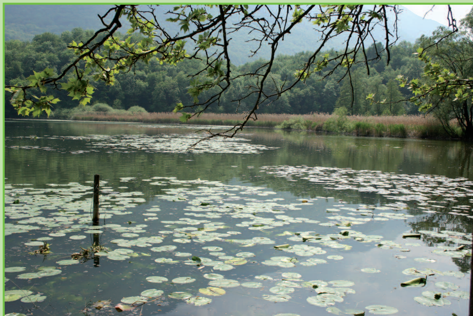
Lake Piano

If you wish you can continue the walk along the cycle – footpath and in 40 minutes reach the town Porlezza on Lake Lugano that is connected with bus line C12.