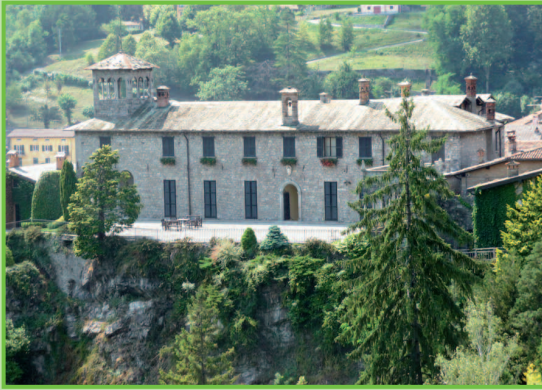
Villa Bagatti Valsecchi

centre. The villa and its park can be visited on Thursday afternoon at 14.30 (tel. 0344 361232). You pass the church San Lorenzo with its baroque façade and the sport centre and then, after a brief ascent, you reach Piamuro , a big pasture (40 min. from Menaggio). From here go straight on following trail n°4 of the Parco Val Sanagra. After a few hundred meters you skirt a small pine wood on your left where you ignore the deviation for Tobi / Torre Galbiati and proceed another 100 meters. At the limit of the pine wood, near a gate, take