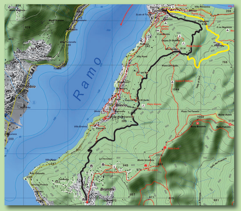
©Provincia di Como - Settore Turismo - DISTRIBUTED FREE OF CHARGE

The bus stop back to Como is along the main road via Roma, while the boats leave regularly from the beautiful harbor-square, piazza Casartelli.